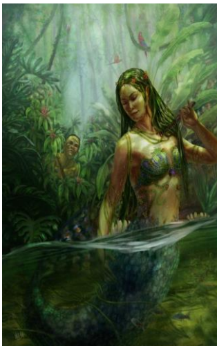
Iara- Lady of the Brazilian Waters

Drops Page 1 Ripples Page 2 Irrigation Page 3