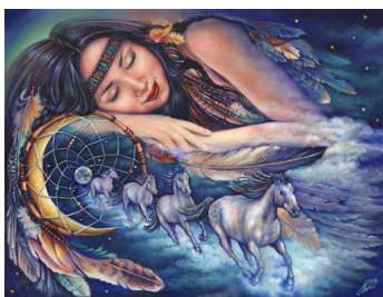
"Path Of The Dream Catcher" by Gloria West

http://www.porterfieldsfineart.com/GloriaWest/pathofthedreamcatcher.htm