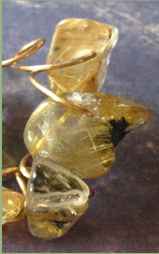
Rutilated Quartz Cluster Pendant

The name Quartz comes from the Saxon word Quertklufferz which means cross vein ore. It is the most abundant mineral in the earth's crust.