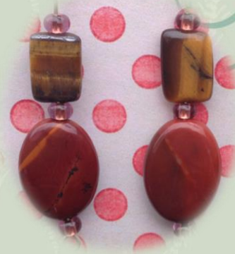
Tiger Eye & Mookaite Earrings