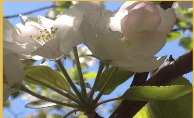
Apple Blossoms in Cheltenham

Today, I saw a large Turtle squashed in the middle of a semi-busy residential road. I felt badly for the little guy. You could tell by his size that he had been on the planet for many, many years. In the aboriginal tradition Turtle represents Earth. North America is called Turtle Island. I rang the Humane Society and so had someone else before me, but we could all learn from Turtle to slow down and watch out before it is too late.