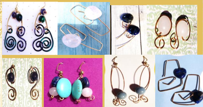
Latest "In-spiral-ations" Earrings with Iolite, Lapis, Serpentine, Rose Quartz, Sodalite, & Angelite

It is also a warming stone and as such is healing for those with asthma or bronchitis. It is best worn as a chest length pendant for this purpose or taped to the skin. Tiger Eye, with its golden tones also supports personal power via the solar plexus. It attracts prosperity and like Citrine can be kept in the cash box. In Feng Shui Tiger Eye is used to increase calm and patience. It is especially useful to place in children's rooms.