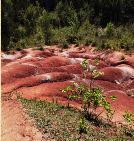
The Cheltenham Badlands in Caledon Ontario

It was the week of my birthday in May when I decided to pay a visit to the Badlands near Cheltenham. I have always wanted to explore them. I had driven past them on occasion, but never really walked around them. Since I had heard they would be fenced off the next week for a few years while conservation authorities review how to better preserve the land, I knew it was now or never. It had been cold and wet all week and I wasn't sure I wanted to go out. It would have been easy to sit inside and read by the fire instead, but I overcame my ennui and off I went. They are less than 40 minutes away by car. I chortled at how quick and easy it was to get there after procrastinating for all those years about going.