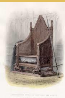
Clach-na-Cinneamhain The Stone of Scone

"Unless the fates be faulty grown And prophet's voice be vain Where'er is found this sacred stone The Scottish race shall reign"