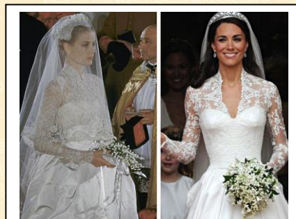
Princess Grace of Monaco and the Duchess of Cambridge both had bridal bouquets of Lily of the Valley

Lily of the Valley is a woodland flower that blooms in May. It represents the return of happiness in Victorian language of flowers. It signifies purity, chastity, good luck and faithfulness. It is often used in wedding celebrations. In France, it is customary to give a sprig of muguet on the first of May for good luck. This tradition dates back to the Renaissance. For the Celts, May 1 was the feast of Beltane celebrating the beginning of summer. Lily of the Valley is very fragrant and used in perfumes. It is also toxic, although it has been used medicinally in the treatment of the heart and for epilepsy. Christian legend suggests Lily of the Valley grew from where the Virgin Mary's tears fell at the foot of the cross.