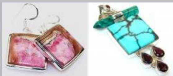
Rhodochrosite, Turquoise, Malachite and Garnet