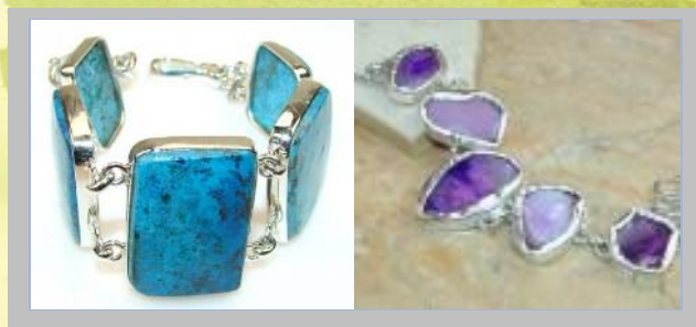
Chrysocolla and Agate slice bracelets